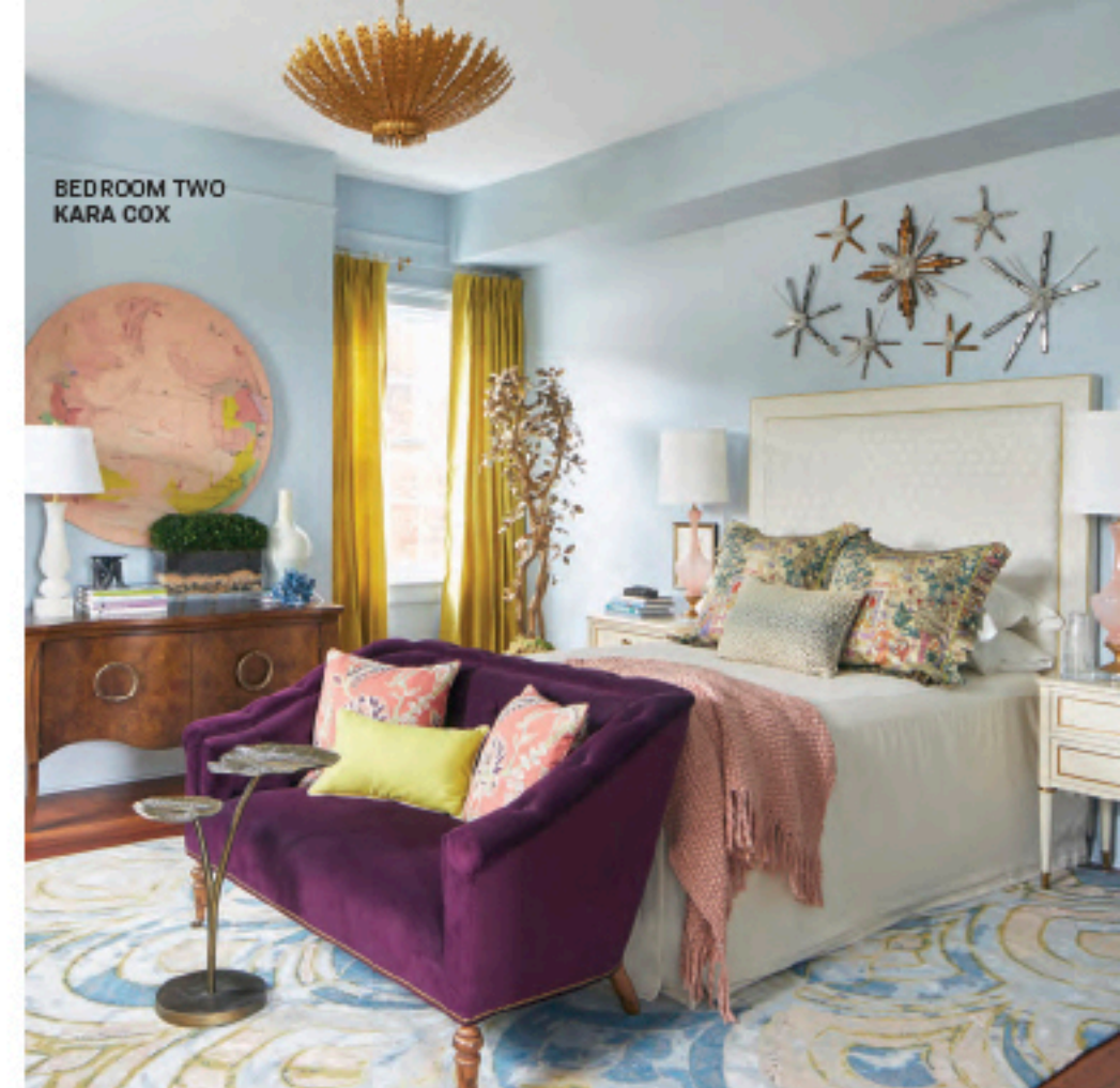
BEDROOM TWO KARA COX