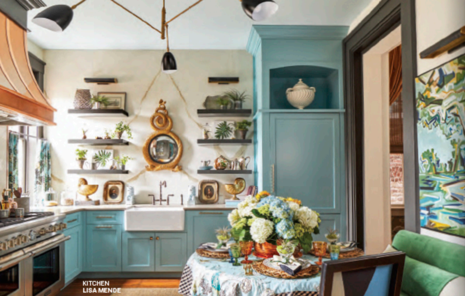
KITCHEN LISA MENDE