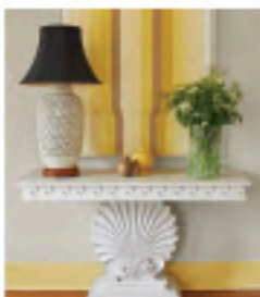
Ballard Designs ballarddesigns.com