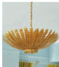
Circa Lighting circalighting.com