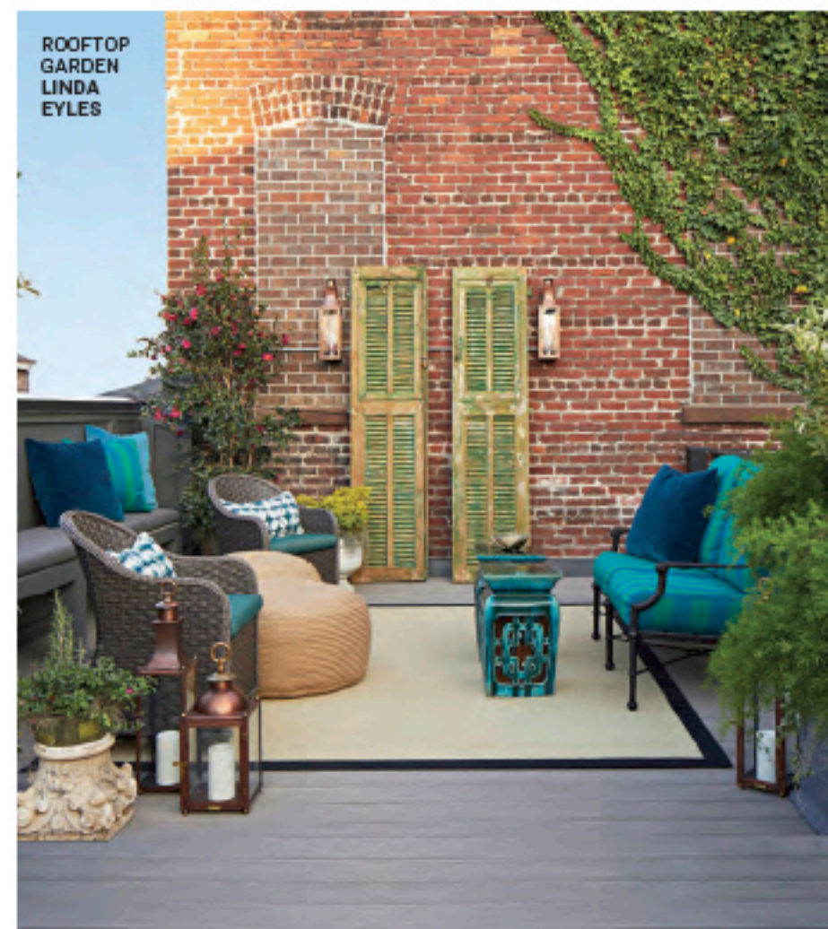
ROOFTOP GARDEN LINDA EYLES