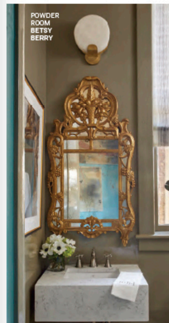
POWDER ROOM BETSY BERRY