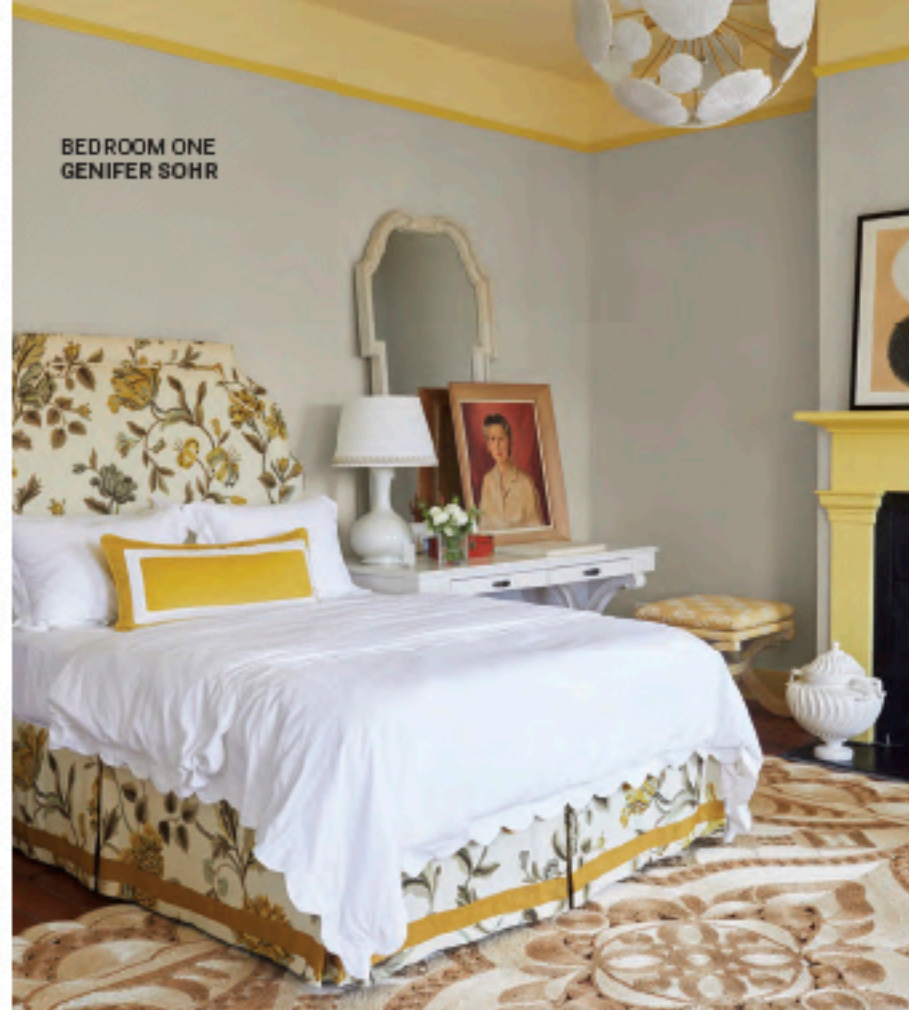
BEDROOM ONE GENIFER SOHR