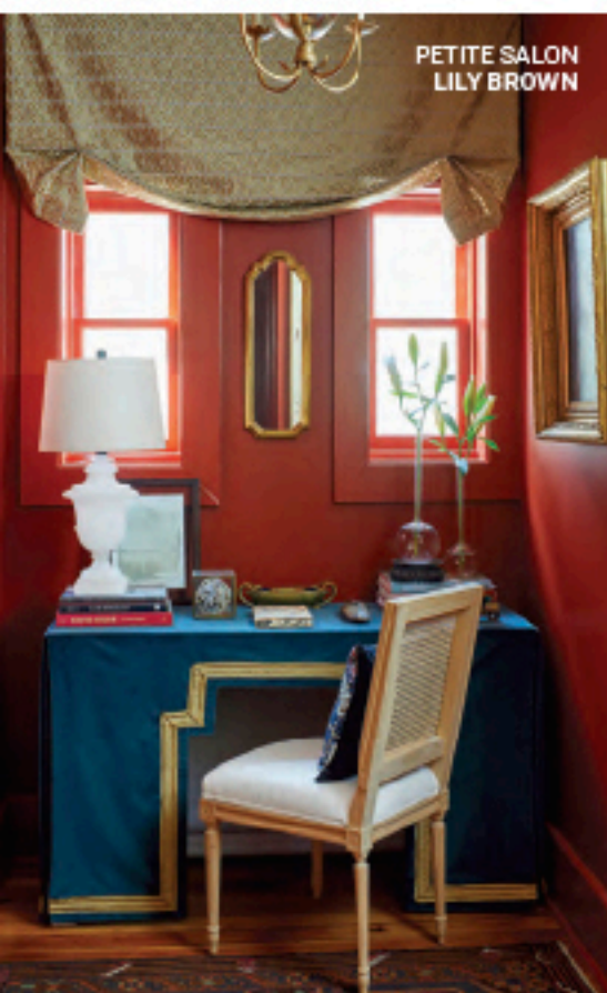
PETITE SALON LILY BROWN

corner, a tufted armchair—also by Wesley Hall—is covered in a Schumacher floral chintz fabric. Roses, peonies, and orchids from Natural Decorations Inc. fill Asian vases on an 19th-century carved giltwood console. The custom abstract is by Sally King Benedict. Burlwood bedside tables from Modern History and an abaca rug complete the collected sanctuary.