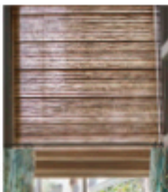
Hunter Douglas hunterdouglas.com