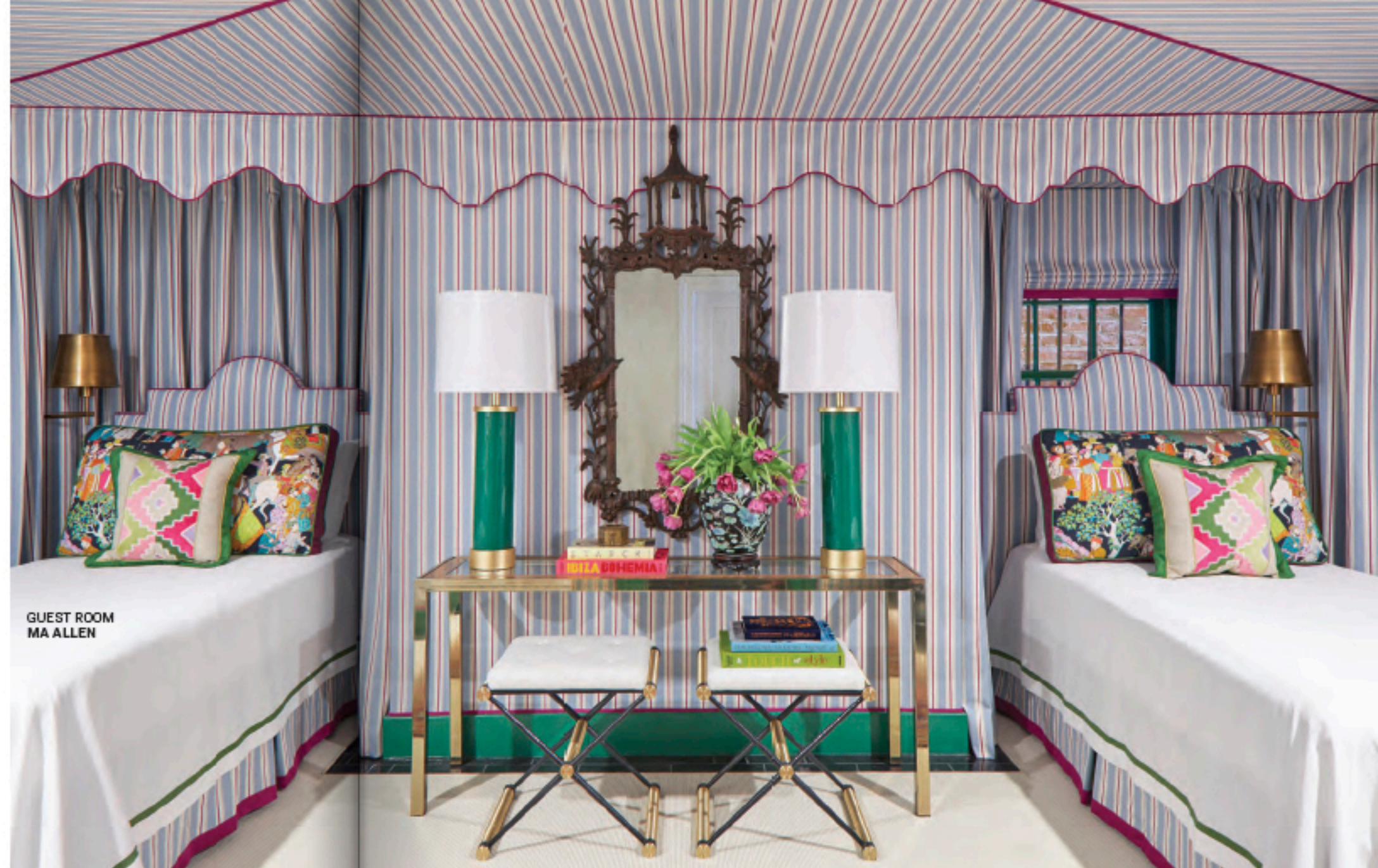
GUEST ROOM MA ALLEN