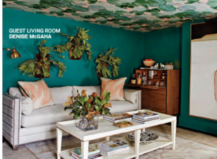
GUEST LIVING ROOM DENISE MCGAHA