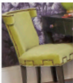
CR Laine crlaine.com