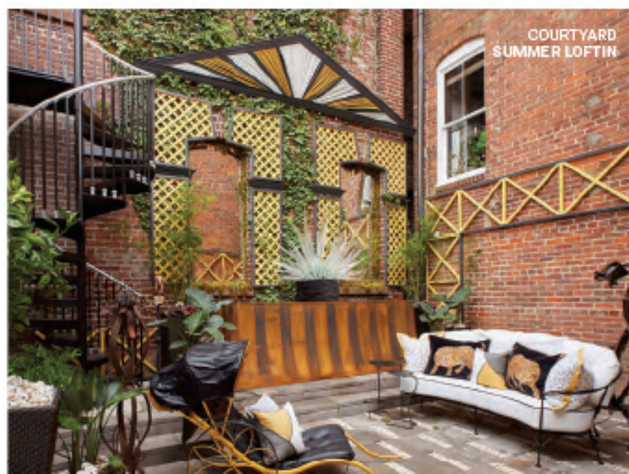
COURTYARD SUMMER LOFTIN