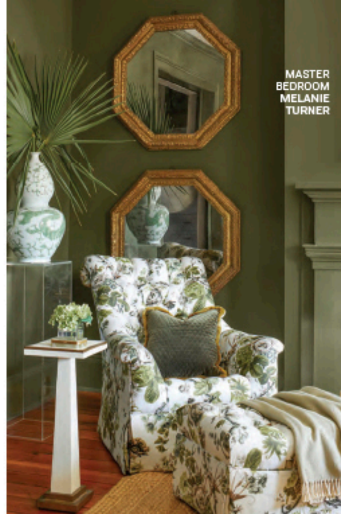
MASTER BEDROOM MELANIE TURNER