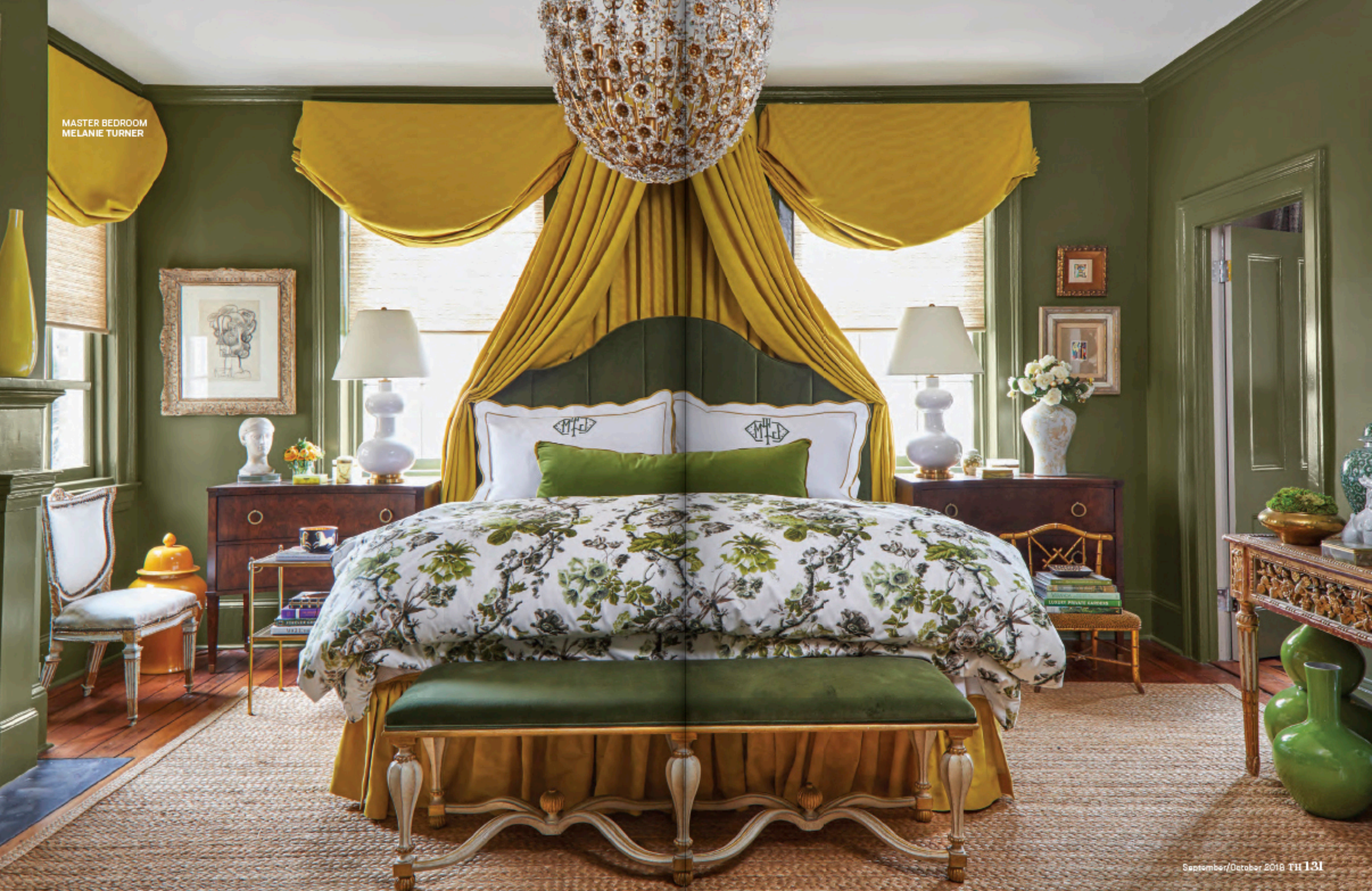
MASTER BEDROOM MELANIE TURNER