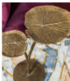
Currey & Company curreyoodsealers.com