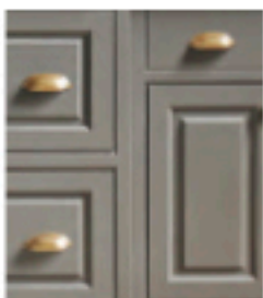
Cabico Custom Cabinetry cabico.com