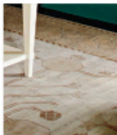
Nashville Rug Gallery nashvillerruggallery.com