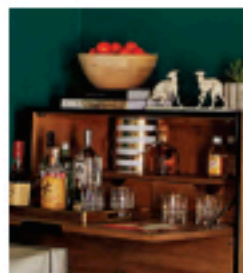
A.R.T. Furniture arthomefurnishings.com

Our sincere gratitude to the generous sponsors who made this showhouse possible