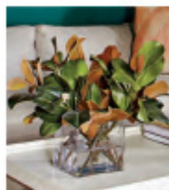
Natural Decorations Inc. ndi.com