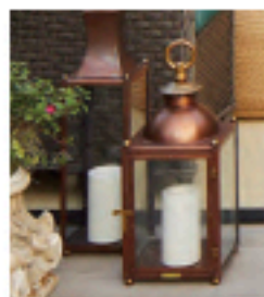
Bevalo Gas & Electric Lights bevalo.com